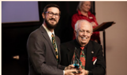
The Hope and Dreams Award was presented to First Christian Church Silent Servants for bringing hope to those with none.