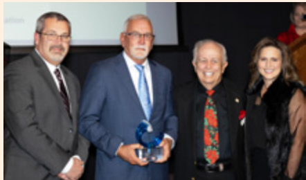
The Tidal Wave Award was presented to the Kenneth Hill Foundation for unwavering support during unprecedented times.